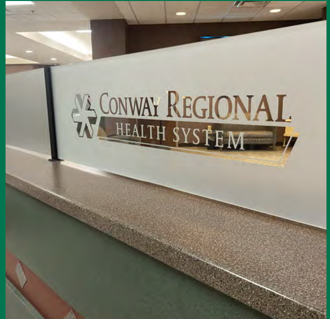
Etched Glass Logos