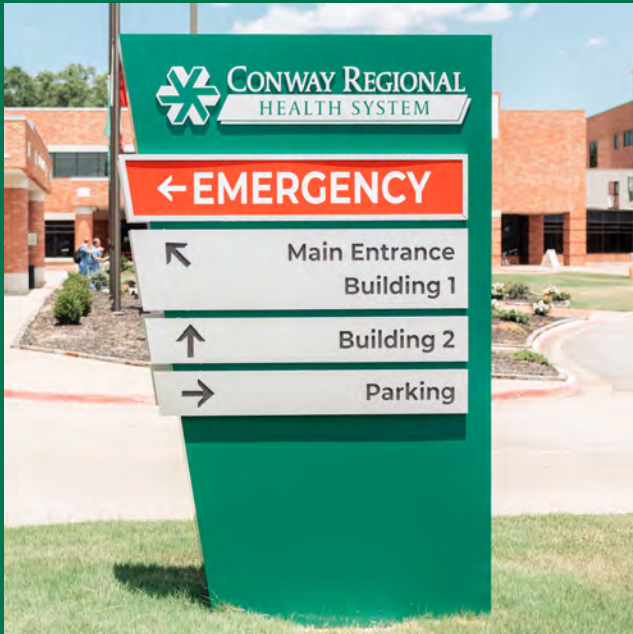
Campus Wide Monument Signage